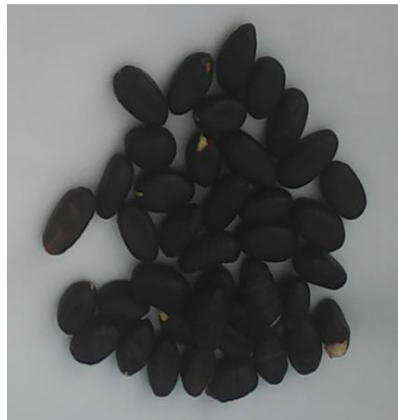
(b) Large Variety