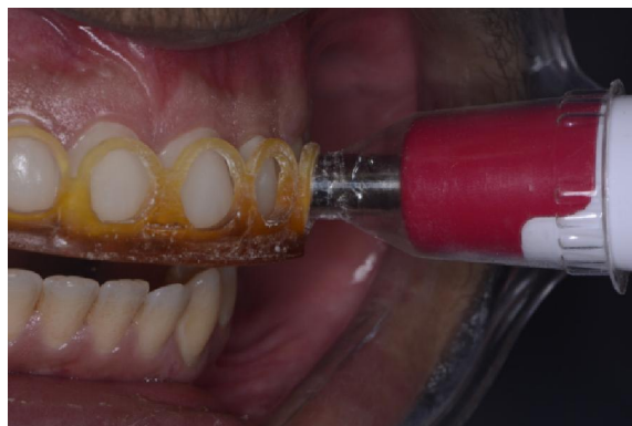
Figure (1) showing Easysshade probe placement into 3D printed stent in the middle third of the CLV.

approved by the Human Ethical Research Committee of the Faculty of Dentistry, Mansoura University.