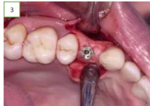
Figure 3: Implant after placement.