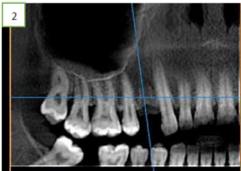
Figure 2: Preoperative CBCT (panoramic view)