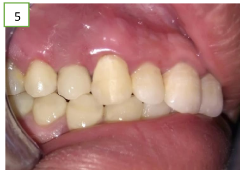
Figure 5: The final restoration.