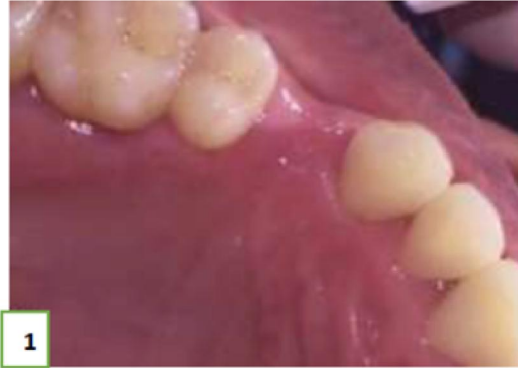
Figure 1: Occlusal views showing missing 1 st premolar