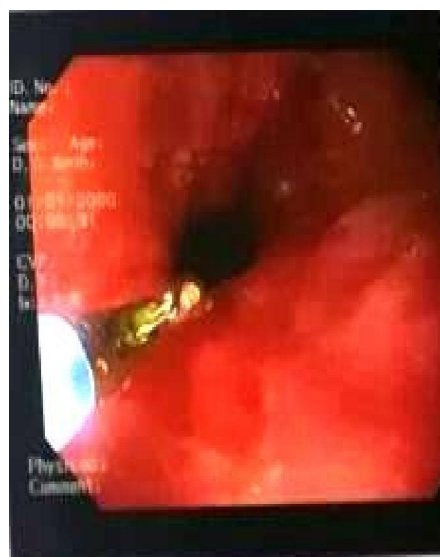
Figure (2): Long segment of Barrett's esophagus with biopsy taken