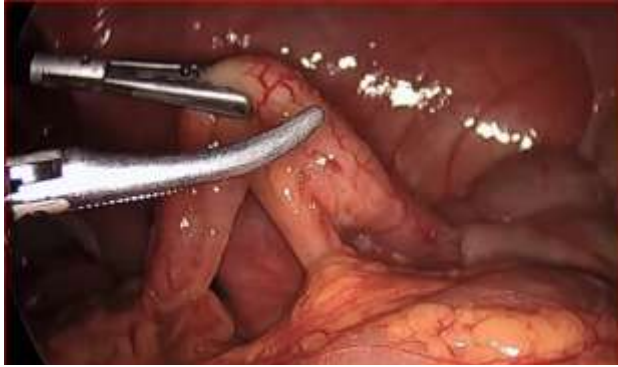
Figure (2): Laparoscopic appendicectomy.