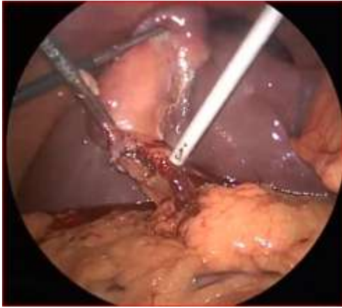
Figure (4): Laparoscopic cholecystectomy.

Hormone levels (such as LH, FSH, estradiol, and testosterone) may be checked to evaluate for associated hormonal conditions.