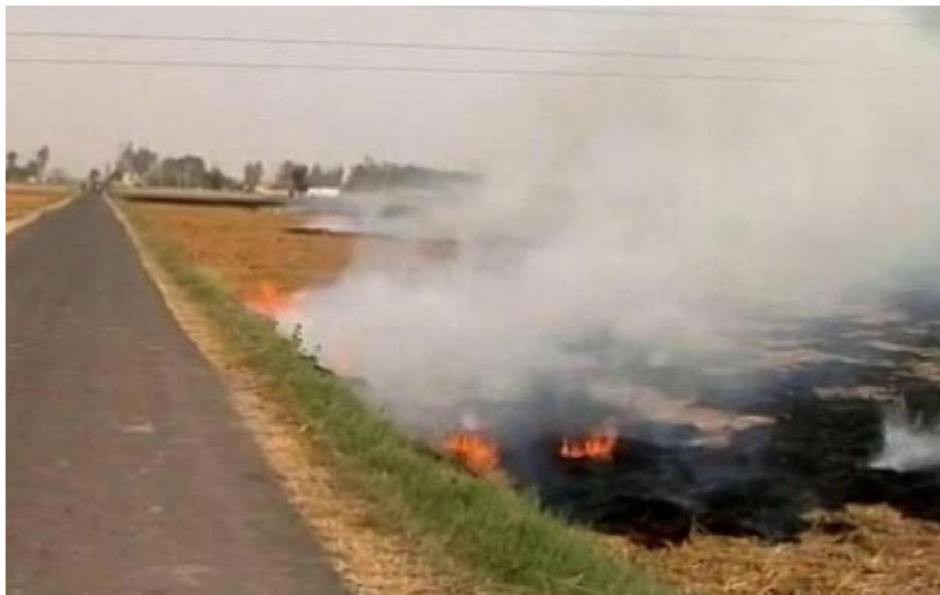
Figure 3: Farmer keeps on straw burning despite of ban by authorities.

It can be seen in figure 2 & 3, plumes of smoke are rising from the fields which by the end of October or sooner, becomes a thick blanket of smog in the air over northern states of India extending up to the national capital region (Sandhu 2016). It's the season for paddy crop residue burning, for preparing the blank plots to cultivate wheat.