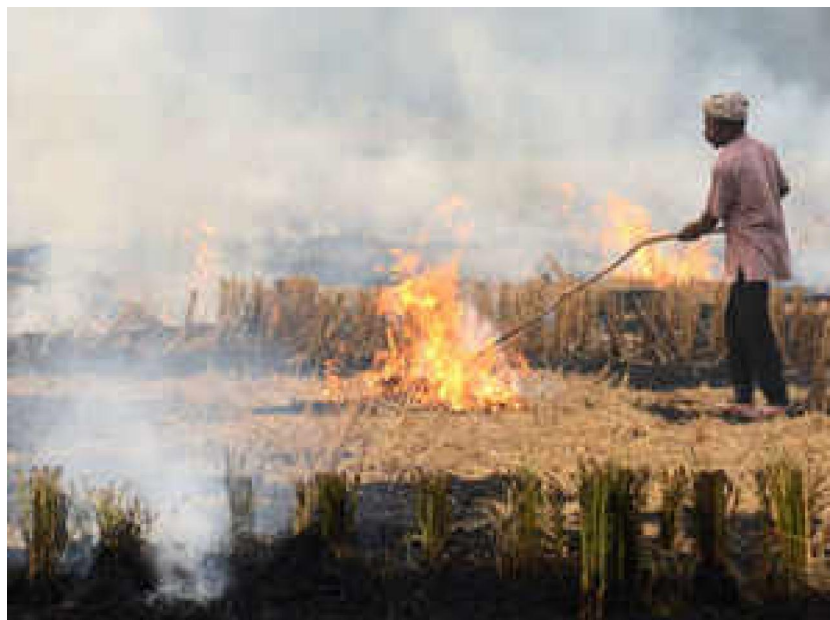
Figure.2: In situ stubble burning after harvesting of crop.